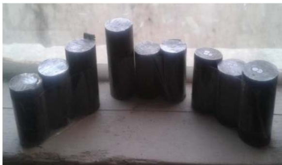
Fig 7. Overview of all specimens related with the study